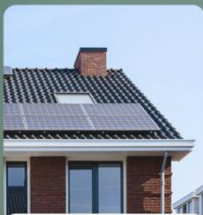
01 FOR Home use