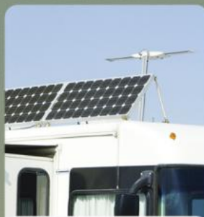
04 FOR RV