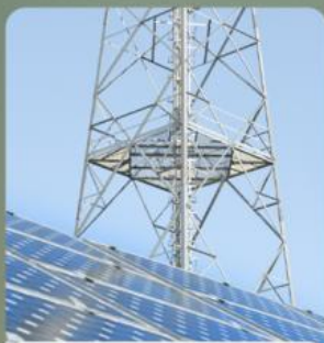
03 FOR Base Station