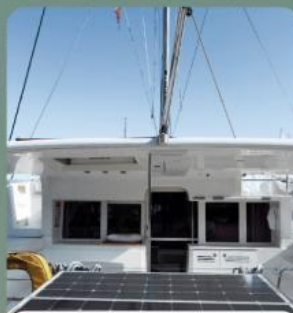
02 FOR Yacht